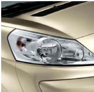
506 Golden White