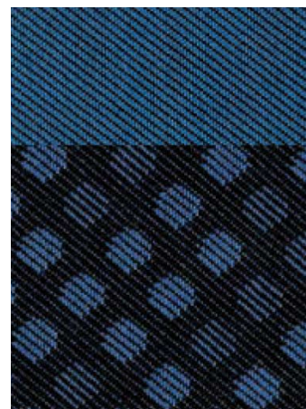
148 Pois Blue Fabric