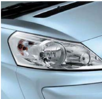
453 Lake Blue